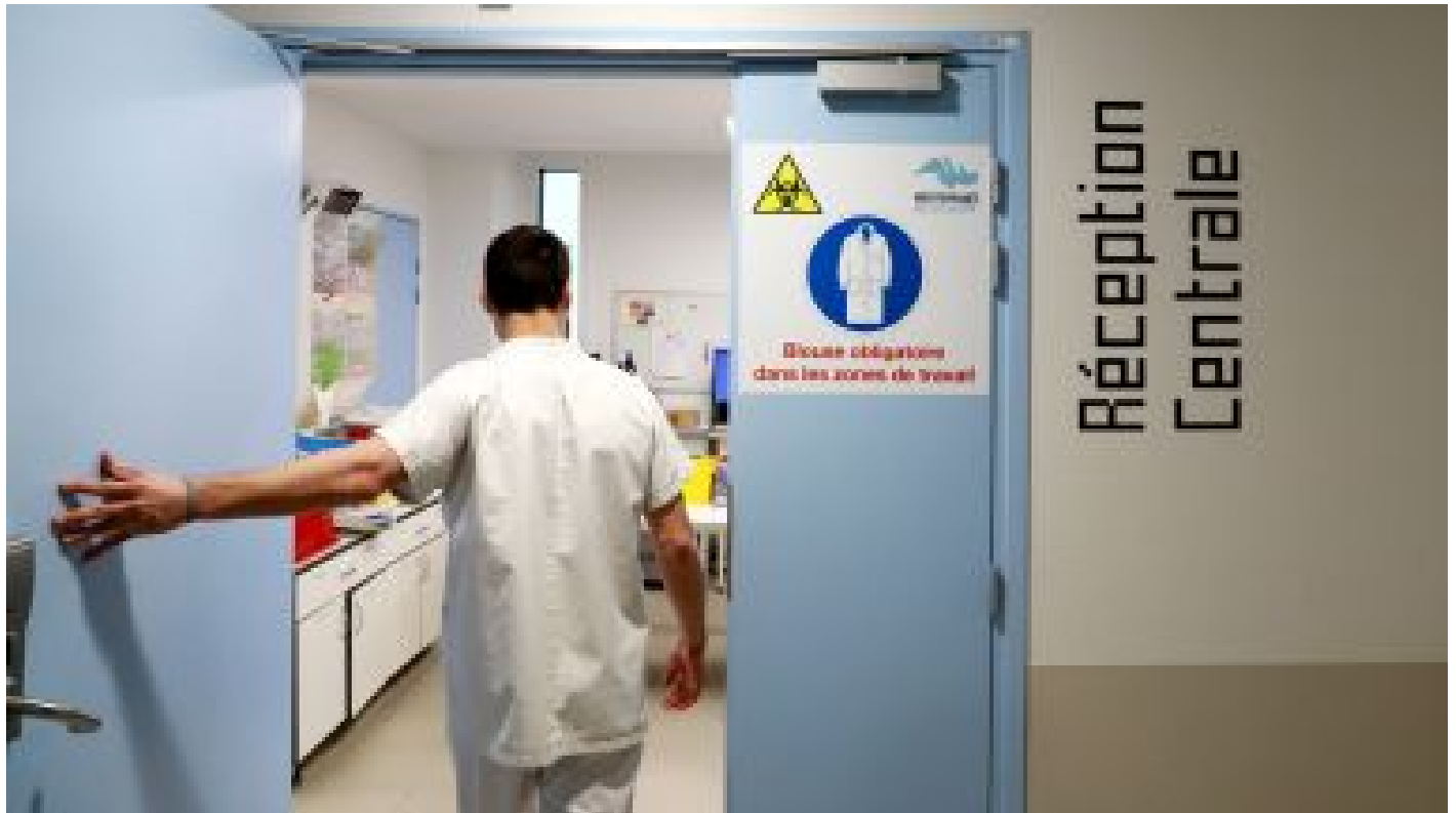
The Institut Hospitalo-Universitaire Méditerranée Infection, the Covid-19 reference center, in Marseille (Bouches-du-Rhône).

This treatment uses a precise dosage: "600 mg per day for ten days", details the professor in his intervention.